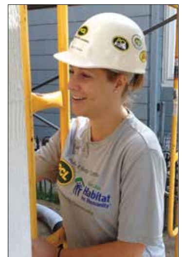
The Builder's Circle, Ecolab, Holy Hammers, and PCL were all primary sponsors of homes built in St. Paul's Frogtown neighborhood this summer. More than 1,500 St. Paul residents volunteered with Habitat for Humanity this year.