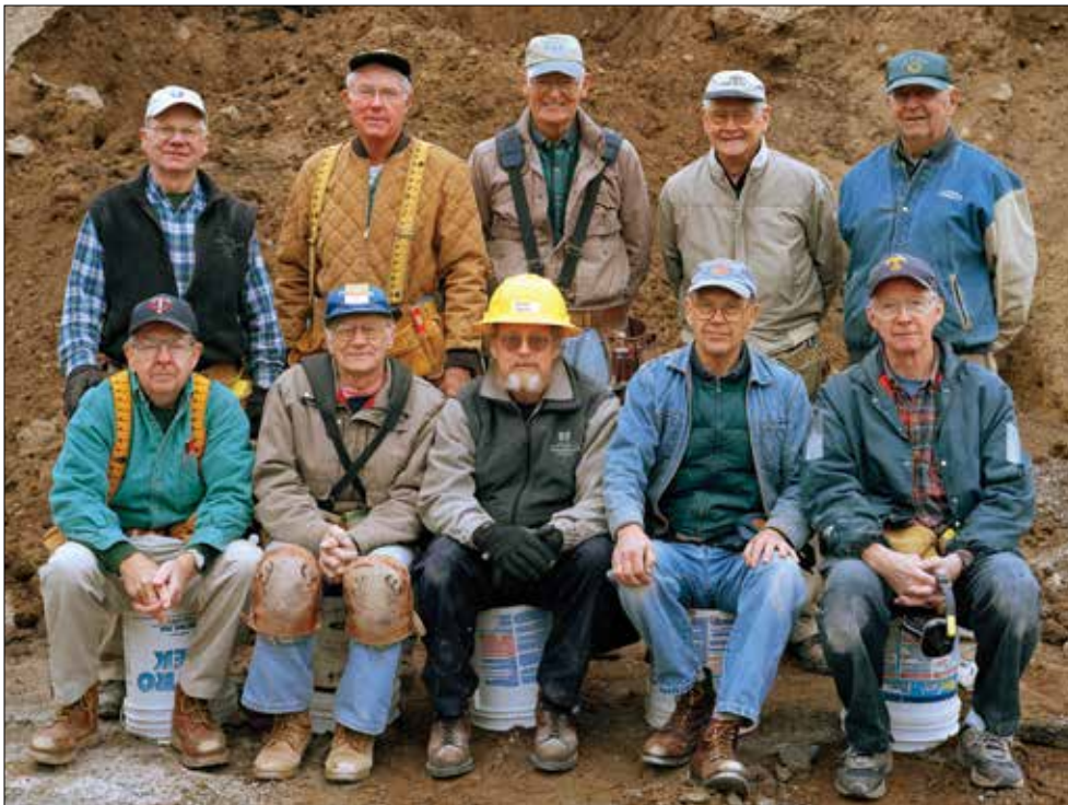
Regular volunteer crews, like Buck's Crew (2008) are the backbone of Twin Cities Habitat.