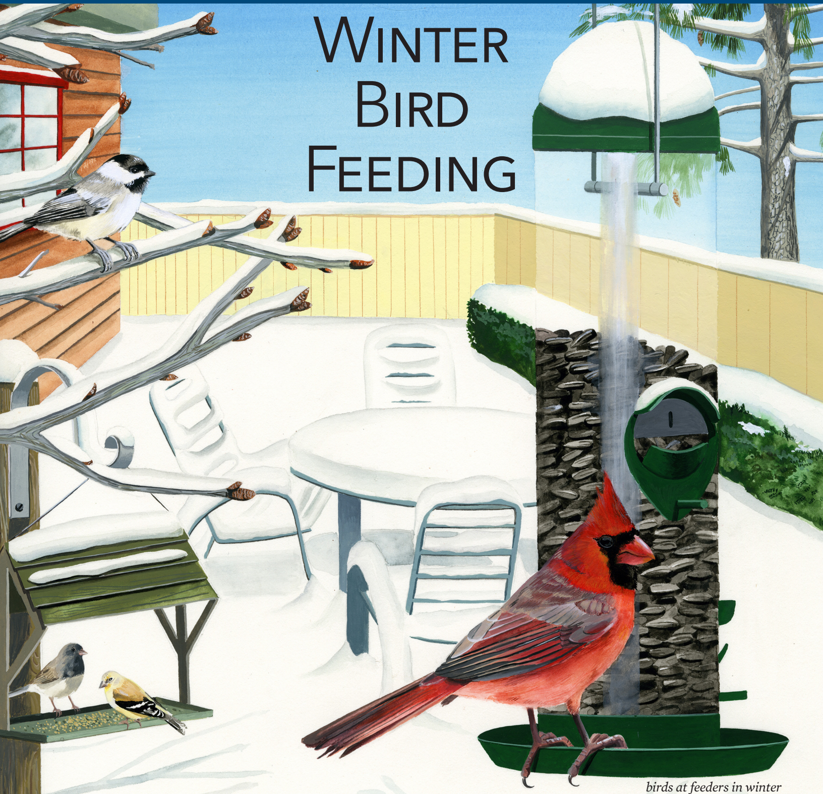
birds at feeders in winter

If you feed birds, you're in good company. Birding is one of North America's favorite pastimes. A 2006 report from the U.S. Fish and Wildlife Service estimates that about 55.5 million Americans provide food for wild birds.