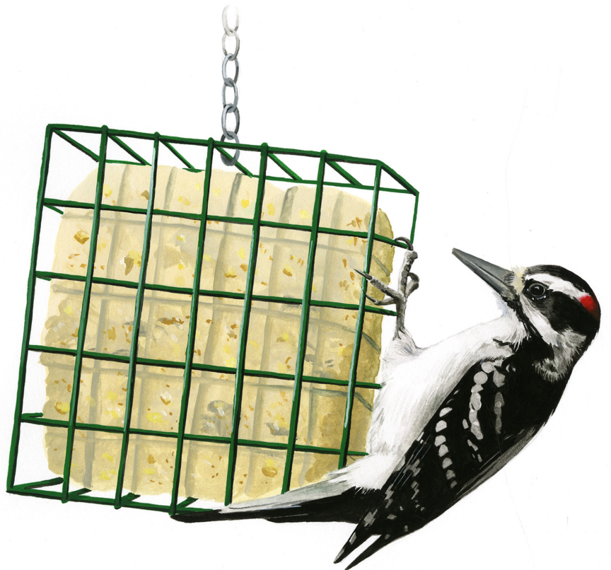
Hairy Woodpecker on suet feeder