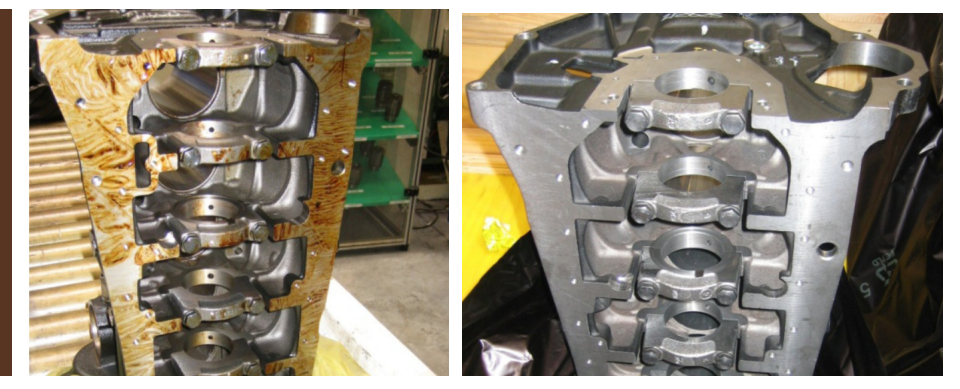
Engine blocks from global sourcing upon arrival at assembly plant.

Ford applies a global approach to addressing the environmental and OH&S aspects to their logistics operations. Over several years Intercept enabled oil free packaging without compromising corrosion protection. Oiling and de-oiling is a major cause towards unsustainable cost impacts. Intercept enables a reduction in processing costs and bottle necks during production and assembly. Intercept avoids unnecessary steps such as washing and de-oiling.