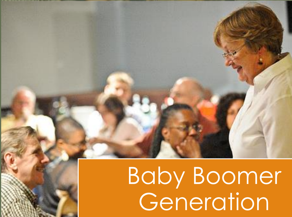
Baby Boomer Generation