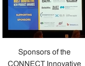
Sponsors of the CONNECT Innovative New Product Awards