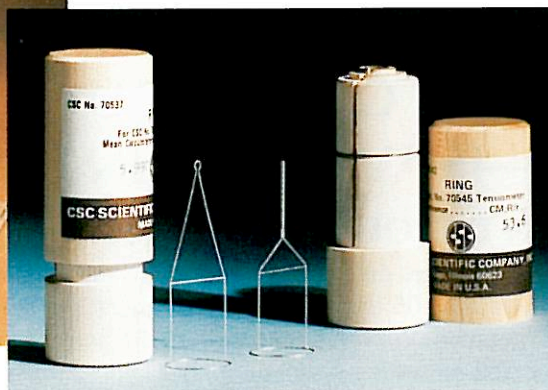
PLATINUM-IRIDIUM 6cm RING

CSC SCIENTIFIC also manufactures laboratory instruments for the analysis of: