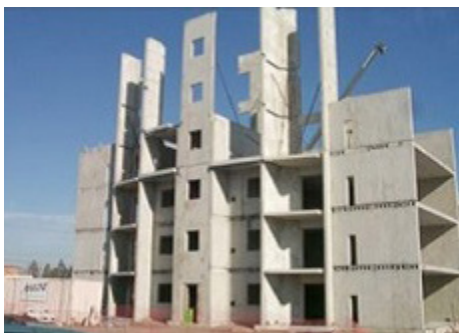
Precast concrete structure being assembled.

Across the spectrum of off-site products, modular, is the most complete in factory finish, up to 95% in some cases, shipped and assembled as 3D volumetric units that are service or structural units to be joined on-site.