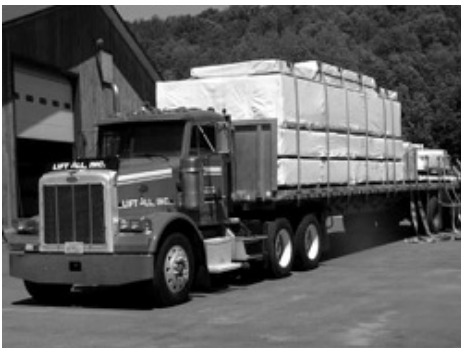
Flat pack delivery.