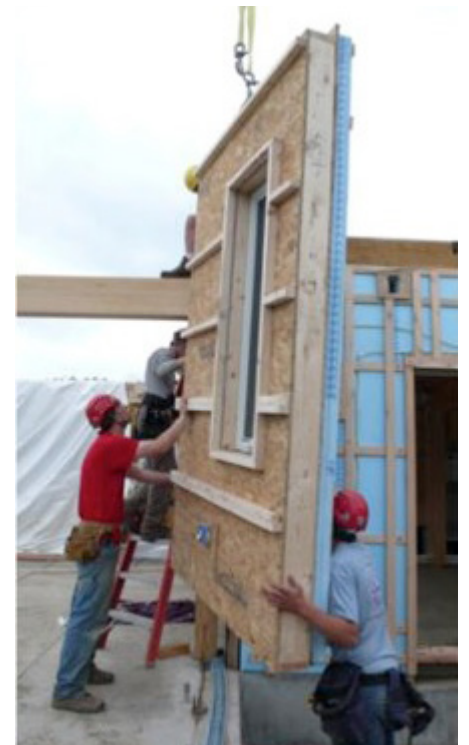
Prefabricated closed panel wall assembly for housing.