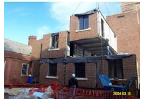
Steel modular and brick veneer at Yale Univ. (Photo courtesy of KieranTimberlake)

Modular buildings, temporary and permanent, may be manufactured as structural units that make up the structure of the building once assembled on-site. Non-structural modular such as factory fitted bathroom or service pods can be placed within a larger modular superstructure or in traditional construction on-site.