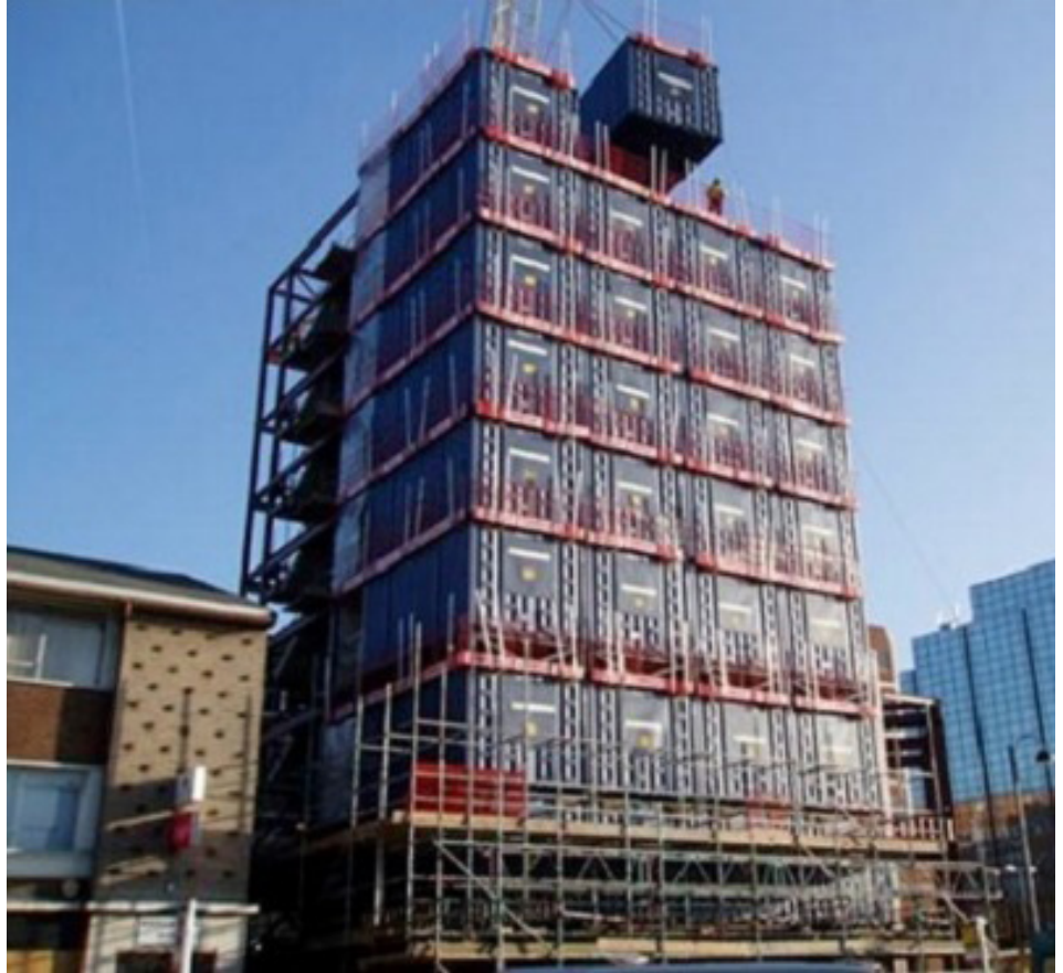
Travelodge construction using off-site container modules.