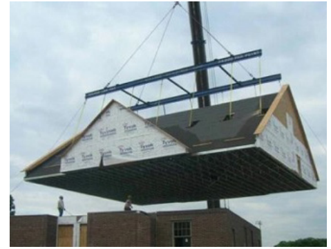
Roof assembly being delivered and installed on-site.