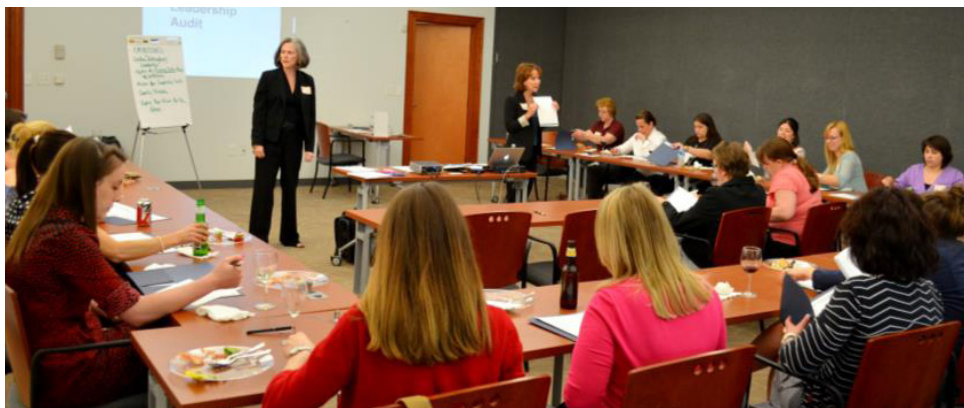
Seminars and workshops are highly interactive and often include the expertise of two Clearwater Consulting Group professionals to better engage the audience.