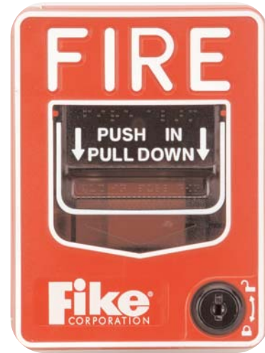
Manual Pull Station