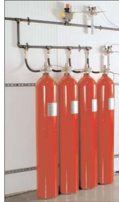
Fike Discharge Hose Kit