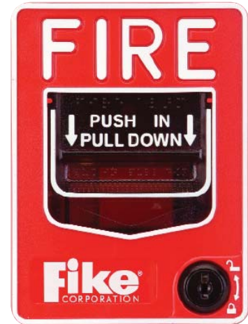
Intelligent Manual Pull Station

Manual Stations shall be Underwriters Laboratories listed. Manual stations shall connect with two wires to one of the control panel SLC loops. The manual station shall, on command from the control panel, send data to the panel representing the state of the manual switch. Manual stations shall provide address setting by use of IR Tool.