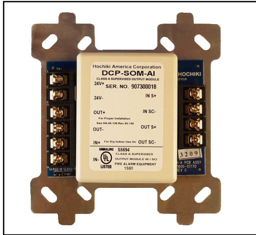
Back side of a SOM-AI

The DCP-SOM-A & -AI shall be supplied with a plastic cover and shall be suitable for mounting to a 4" square or double gang electrical back box. The DCP-SOM-A & -AI shall provide a monitor LED that is visible from outside the cover plate.