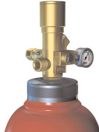
Fike ProInert Valve Assembly

A master or slave actuator is connected to the pneumatic valve actuator. During a system discharge, the master or slave actuator provides nitrogen pressure to the pneumatic valve actuator, causing it to open, which actuates the ProInert valve thus releasing the extinguishing agent. The pneumatic valve actuator has both inlet and outlet ports, allowing up to 60 cylinders to be connected in a series and operated by a single master actuation package.