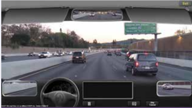
Example of teenSMART driving simulation