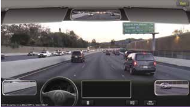
Example of teenSMART driving simulation