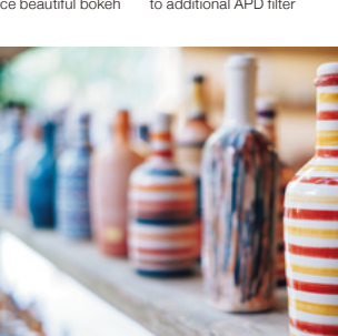
XF56mmF1.2 R APD XF60mmF2.4 R Macro XF80mmF2.8 R LM OIS WR Macro