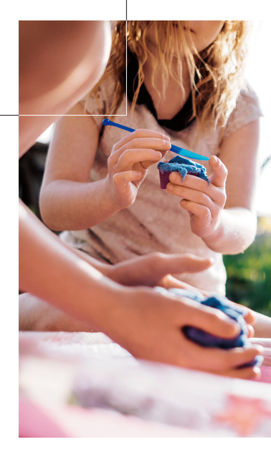
IMAGE QUALITY Color reproduction & Noise handling & Excellent resolution

X-T100 has the essential elements to make all aspects of your pictures look special: natural skin tone, beautiful color reproduction, low noise in poor light, and excellent edge-to-edge resolution. You can trust exceptional images will be produced thanks to FUJIFILM's technology which is established from over 80 years in the photo industry.