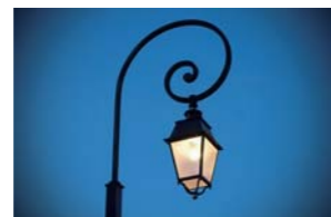
【 Toy Camera 】 Create shaded borders as if you were taking a photo on a toy camera.