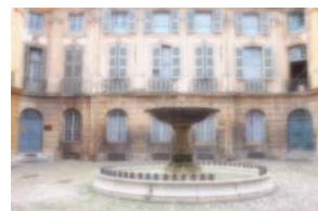
【 Soft Focus 】 Create a look that is evenly soft throughout the whole image.