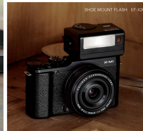
SHOE MOUNT FLASH EF-X20