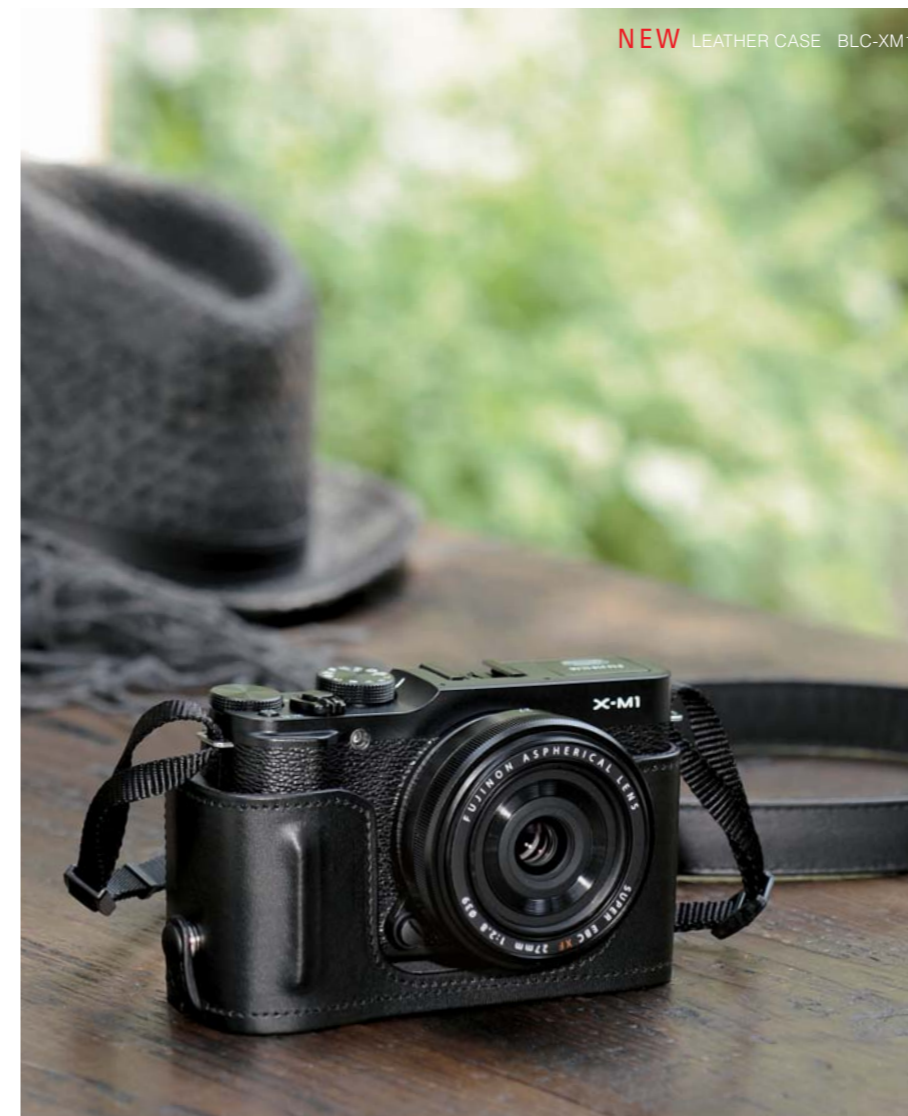
NEW LEATHER CASE BLC-XM1