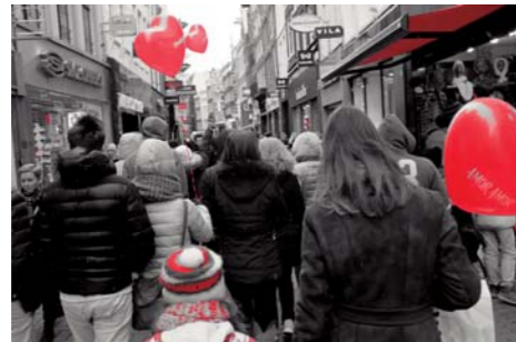
【 Partial Color 】 ( Red / Orange / Yellow / Green / Blue / Purple ) Retain one selected original color and change the rest of the photo to black and white.