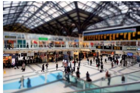
【 Miniature 】 Adds top and bottom blur for a diorama or miniature effect.

Featuring a choice of 8 artistic effects, Advanced Filters make artistic photography as easy as pressing the shutter. Before you shoot, you can preview the effect on the LCD monitor and even fine-tune brightness.