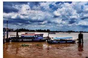
【 Dynamic Tone 】 Create a fantasy effect by dynamically-modulated tonal reproduction.