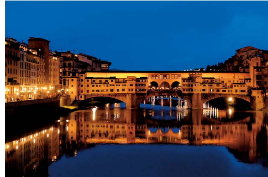
Low noise and high sensitivity.