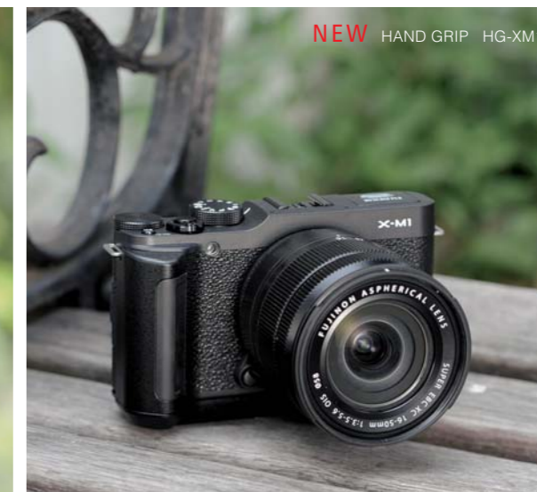
NEW HAND GRIP HG-XM1