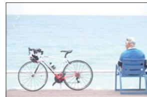
【 High Key 】 Enhance brightness and reduce contrast to lighten tonal reproduction.