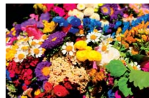
【 Pop Color 】 Emphasizes contrast and color saturation.