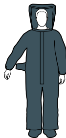
C3T400 Encapsulated suit, rear entry, flat back, 48" zipper, storm flap, 20 mil PVC face shield, elastic wrists, 1 exhaust port with shroud, air tube inlet, attached sock boots with boot flap. Suit is not gas/vapor tight. Sizes: S – 5XL Case Pack: 1