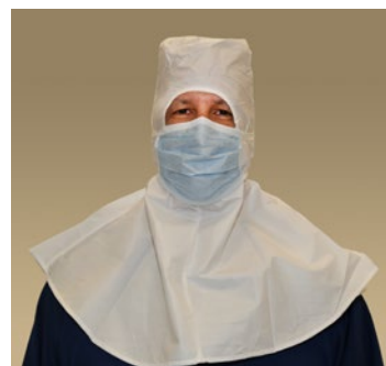
Don Mask – adjust for proper fit (no gaps).