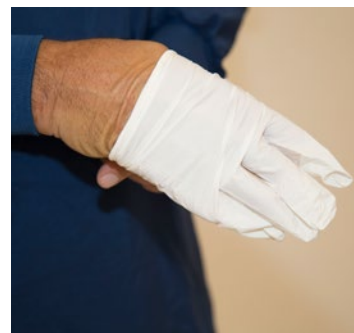
Don a pair of sterile gloves without touching outside surface area of glove.