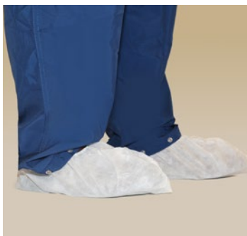
Don disposable shoe covers making sure entire surface of street shoe is contained.