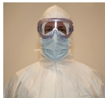
Do final check in mirror prior to entering sterile cleanroom.