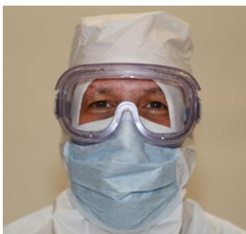
Don Goggles – adjust for sealed fit.