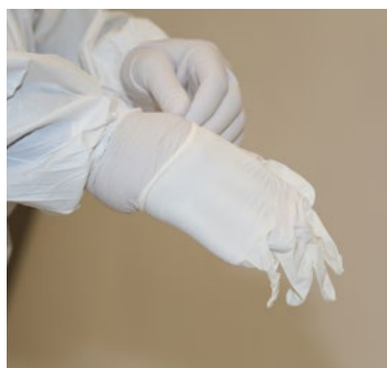
Don Second Pair of Sterile Gloves, completely covering the first pair.