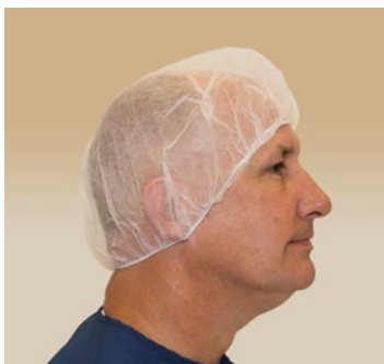
Don bouffant cap, be sure all hair is contained and ears are covered.