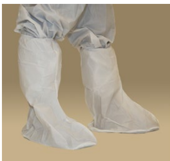
Don first boot cover with approved aseptic technique, then place first donned boot onto "clean side" of gowning area. Repeat.