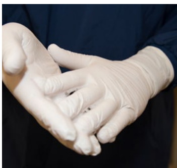
Sanitize gloves – this should be done after each step in the gowning process.