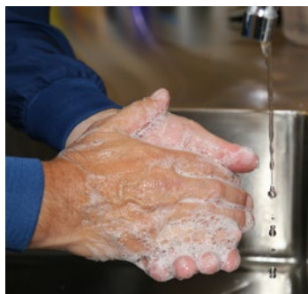
Wash or sanitize hands. Make sure they dry completely.