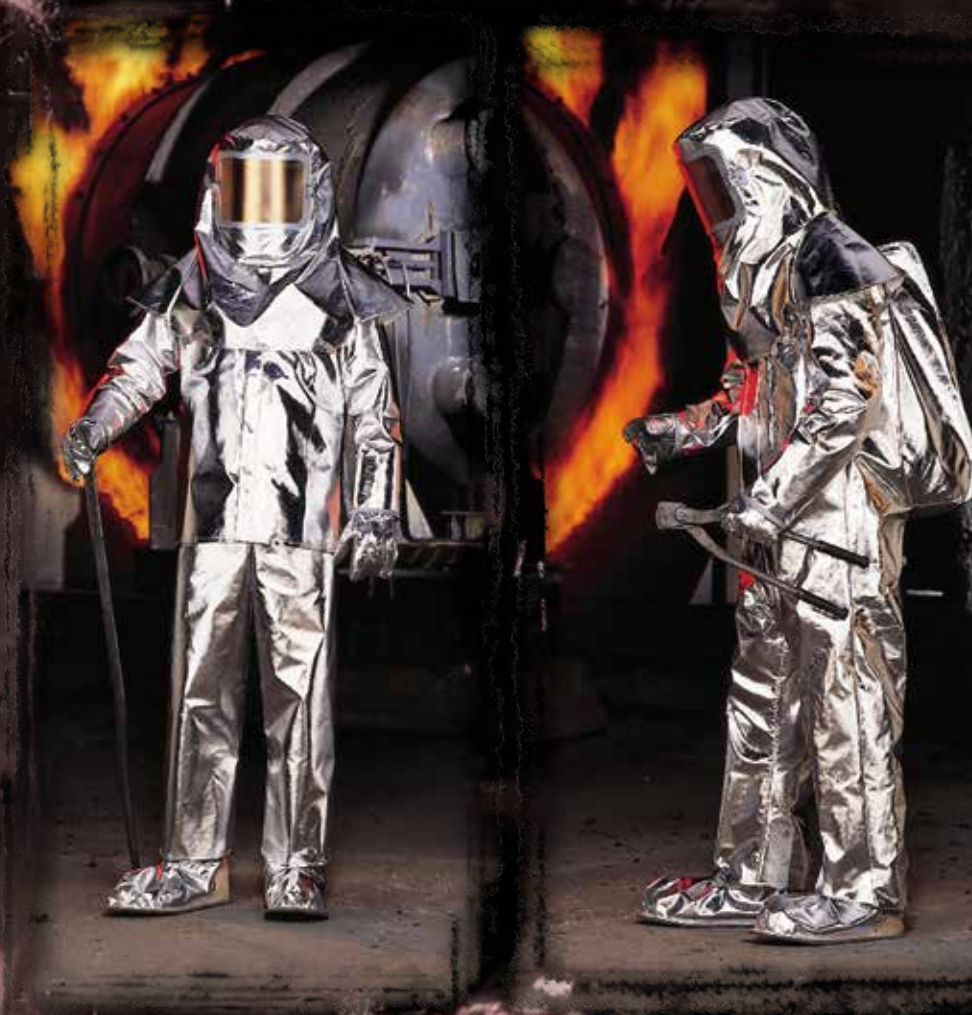
At left, the 500 Series Approach Suit, featuring a coat and pant. Right, the 505 Series Approach Coverall.

The 500 and 505 Series Approach Suits are designed for personnel engaged in maintenance, repair and operational tasks in areas of low ambient, high radiant heat. These superior protective approach suits are available in high temperature Aluminized Fiberglass. An additional moisture/steam barrier lining protects in areas where exposure to hot liquids, steam, or hot vapor is a possibility.