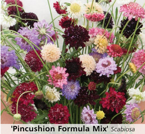
'Pincushion Formula Mix' Scabiosa