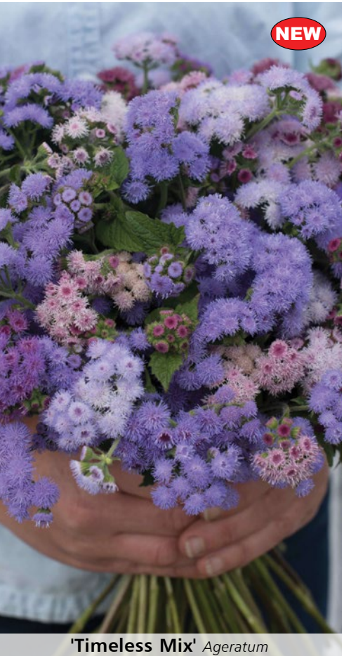
'Timeless Mix' Ageratum