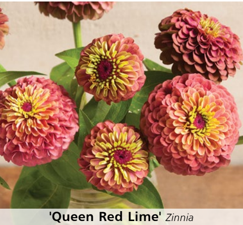
'Queen Red Lime' Zinnia