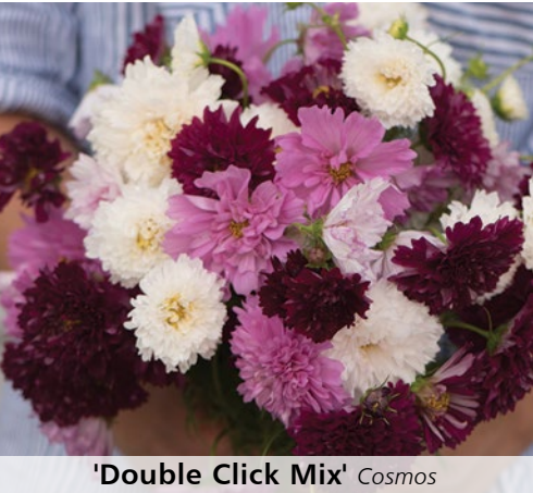
'Double Click Mix' Cosmos