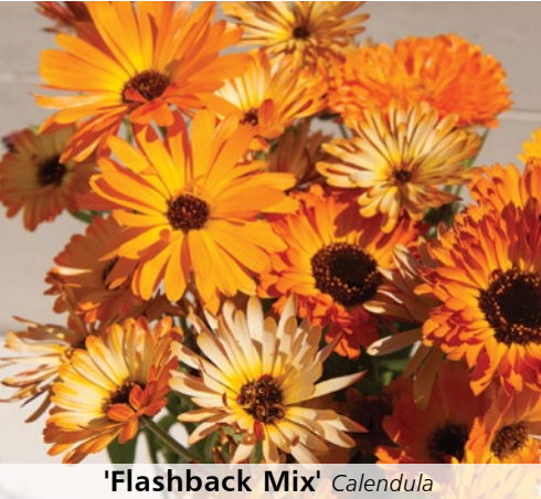
'Flashback Mix' Calendula