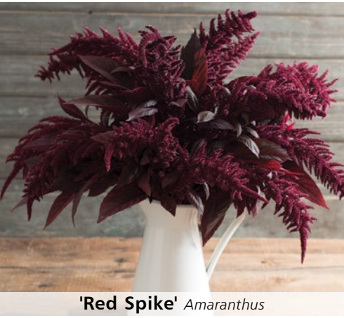
'Red Spike' Amaranthus