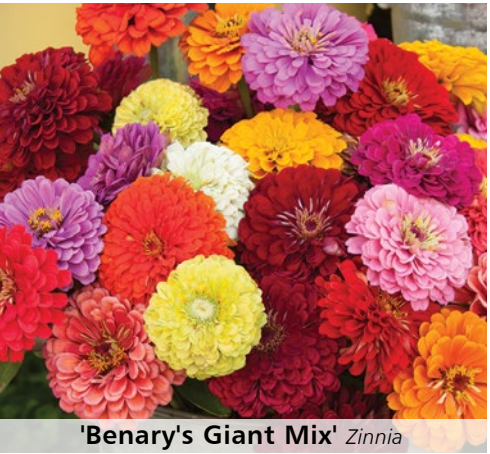
'Benary's Giant Mix' Zinnia