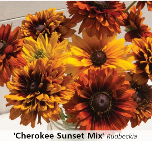
'Cherokee Sunset Mix' Rudbeckia