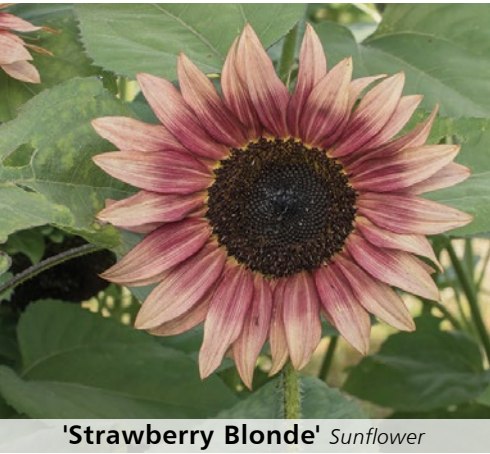
'Strawberry Blonde' Sunflower