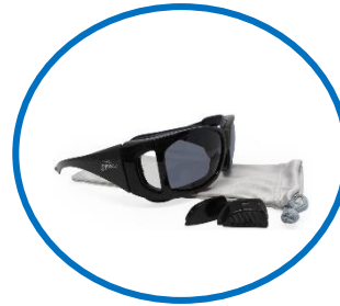
Hydrating daytime eyewear