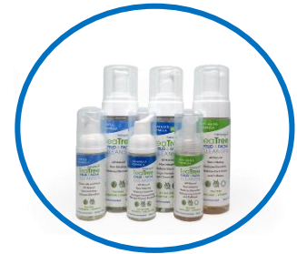
Non-irritating tea tree cleansers

Ongoing, SSF Members Receive 15% off and EE will donate 15% of the purchase to the Foundation.