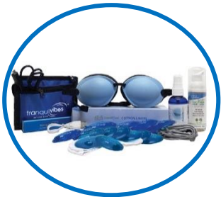
Patented, proven day time moist heat therapies

Offering full line of natural products for dry eye relief including: