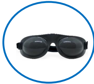
Hydrating nighttime masks