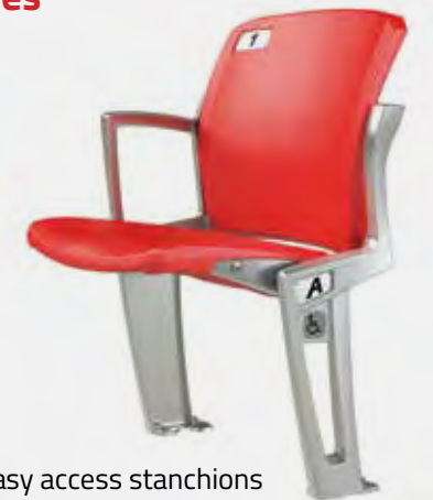
ADA easy access stanchions

Utilizing the proven design of a stanchion-to-stanchion cross shaft through the seat pan, the AURA provides strength and durability that can be counted on over time.