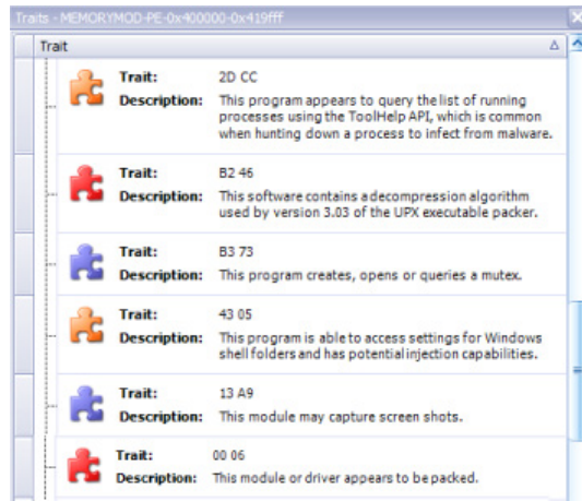
By attempting to disguise itself, the Netwire RAT makes itself appear even more suspicious to Digital DNA.

A separate Traits panel drills down into specific behaviors and gives you fast insight into the unique combinations of tools and techniques favored by individual attackers and groups.