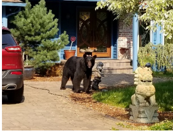
Figure 2: A new neighbor comes to visit