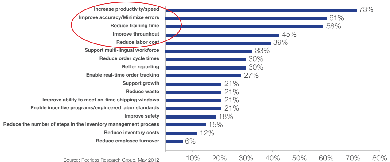
Source: Peerless Research Group, May 2012