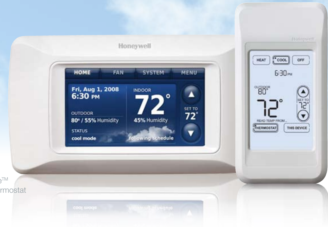
Prestige™ HD Thermostat