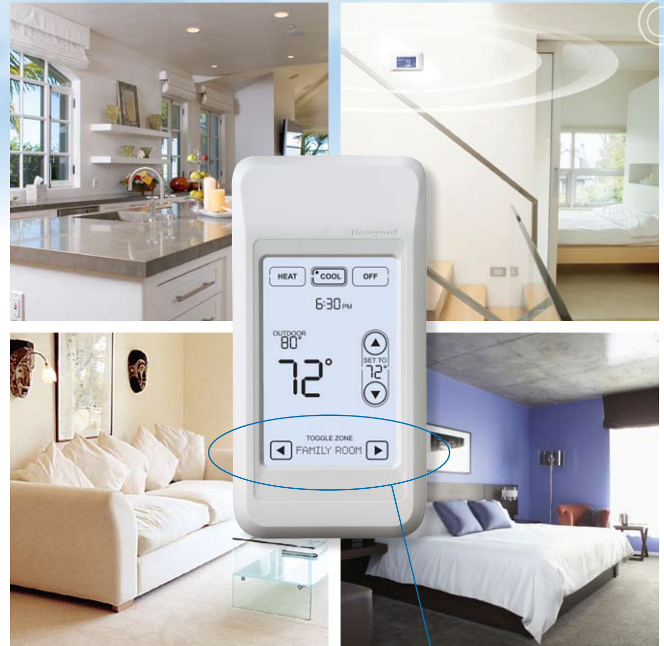
Toggle between zones to set the temperature in any zone from anywhere in the home

The Portable Comfort Control also maintains the schedule from your programmable thermostat. Easily adjust the temperature setting before bedtime to set-back for energy savings after you fall asleep — or turn the system off for easy overnight energy savings.