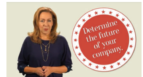
Mission, Vision, Values

"Being a leader is not only about directing someone or something, but about giving guidance."