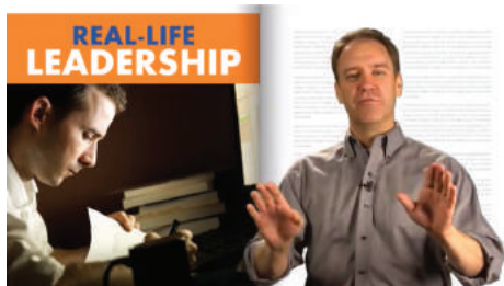
Becoming a Great Leader

"It's vital to know where your strengths and weaknesses lie. "