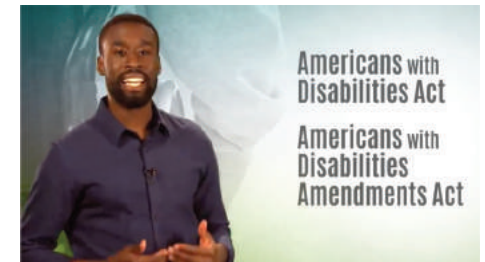
Americans with Disabilities Act

"Everyone deserves to work in a safe and harassment-free environment."