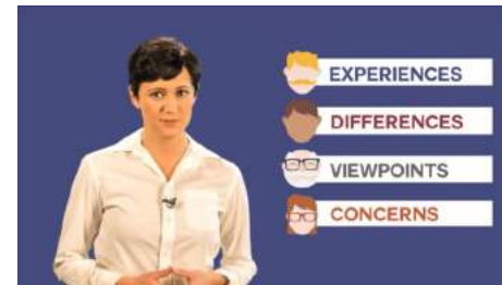
Working Well with Everyone