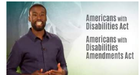
Americans with Disabilities Act

"Everyone deserves to work in a safe and harassment-free environment."