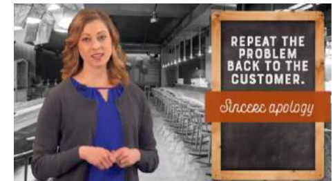
Front of the House

"You never get a second chance to make a good first impression."