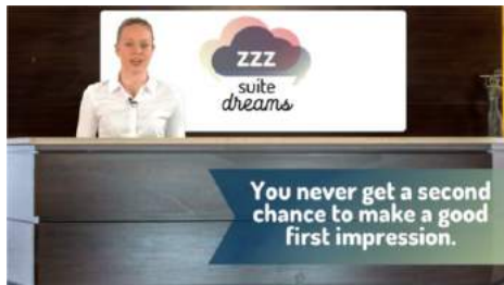
Front Desk Customer Service

"Try putting yourself in the guest's shoes. "