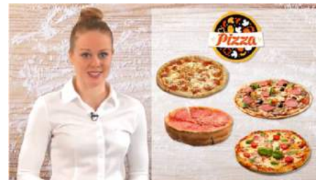
Back of the House