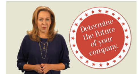
Mission, Vision, Values

"Being a leader is not only about directing someone or something, but about giving guidance."