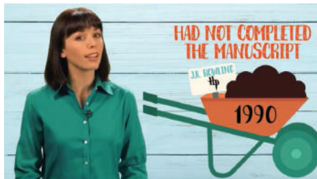
The Growth Mindset

"Successful people enjoy what they do. "