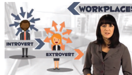
Introverts and Extroverts