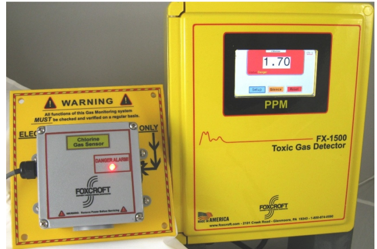
Single Channel FX-1500v4