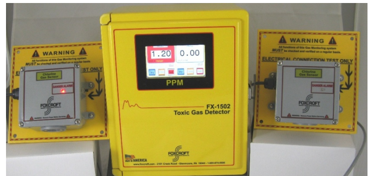
Dual Channel FX-1502v4