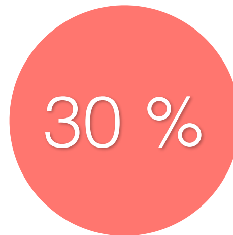
increase in ROI