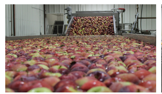
BIN TIP AND CLEAN

A robotic rollover dumper empties bins and transfers the fruit into water flumes for gentle transportation. Fruit is then transported on a roller conveyor through a pressure washer for safe and effective removal of contaminants and pests.