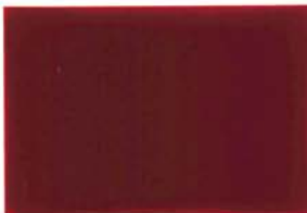
COLONIAL RED TSR 34 E.87 SRI 36