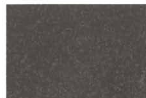
BONDERIZED § 24 GA