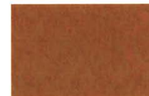
TRUTEN A1008 § 22 GA