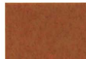
TRUTEN A606 § 22 GA