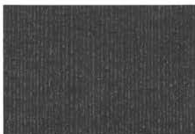
REZIBOND § 26 GA