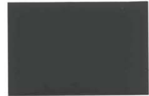
DARK GRAY TSR 30 E.89 SRI 32