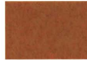
TRUTEN A606 § 22 GA