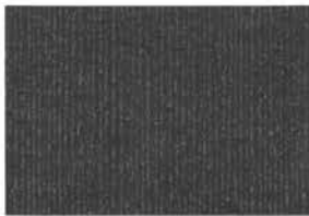
REZIBOND § 26 GA