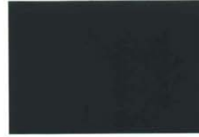
DARK GREEN TSR 26 E.86 SRI 25