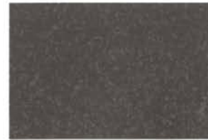
BONDERIZED § 24 GA