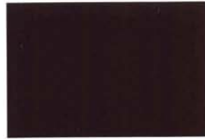
DARK BROWN TSR 30 E.88 SRI 31