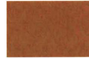
TRUTEN A1008 § 22 GA