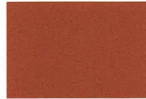
COPPER PENNY ‡ TSR 42 E.87 SRI 47