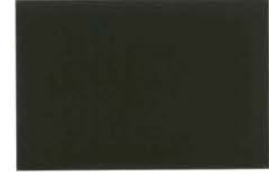
FOREST GREEN TSR 26 E.88 SRI 26