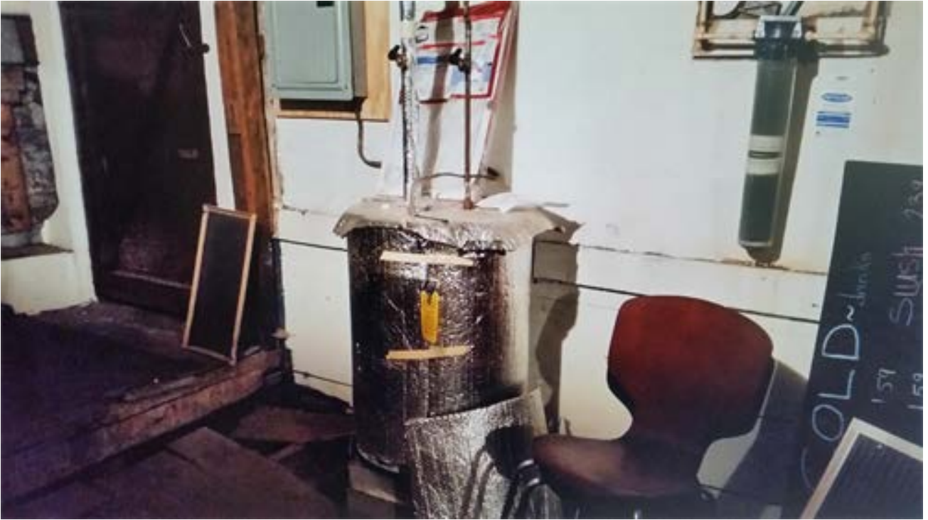
Hot Water Tank