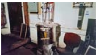
Hot Water Tank