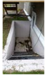
Entrance Area 3