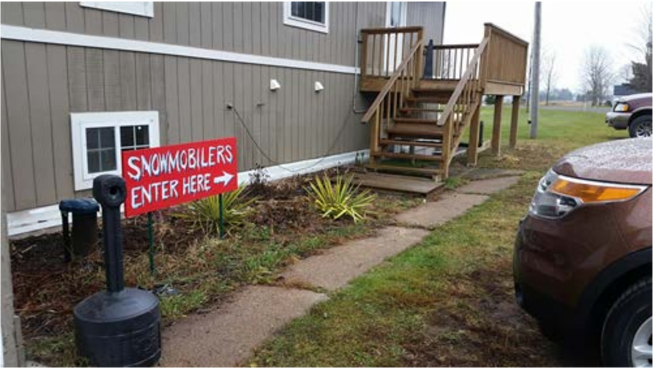
Entrance Area 2