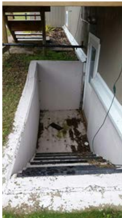
Entrance Area 3