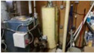
Hot Water Tank