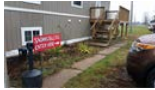
Entrance Area 2