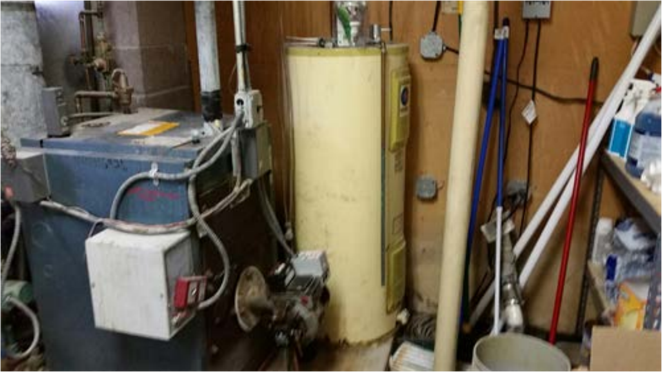
Hot Water Tank