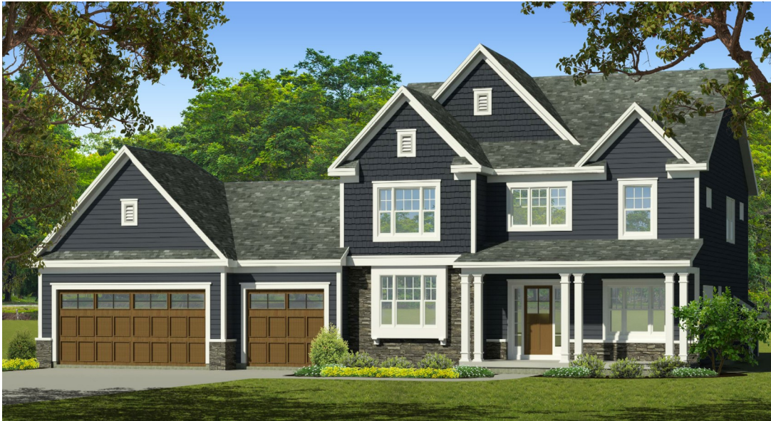
The Magnolia (2619 SF)