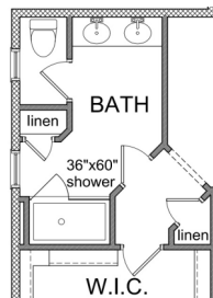
Alt. M bath Layout