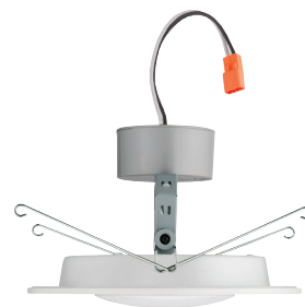
6SL Series Downlight without Speaker

The 6SL Companion Downlight is the perfect way to complement a space with the same look and feel, but without a speaker unit in every fixture. Choose between standard grill-style or smooth surface interchangeable faceplates - both included. Individual speaker assembly units - see below - can also be added at any time to create a fully functional 6SL Speaker Downlight.