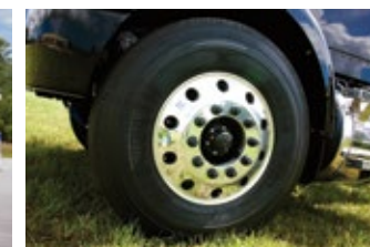
Aluminum wheels standard