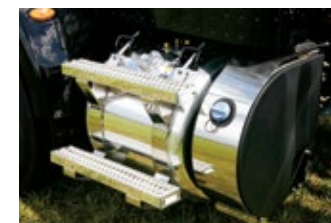
Polished fuel and DEF tank standard

Disclaimer: Some ratings not available with AWD or all cab styles.