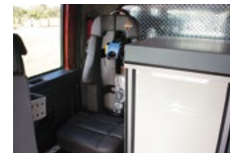
Crew cab with SCBA

Disclaimer: Some ratings not available with AWD or all cab styles.