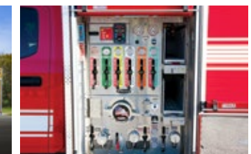
Ergonomically arranged pump controls engineered for serviceability