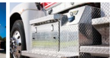
T370 rear fuel tank – batteries in step