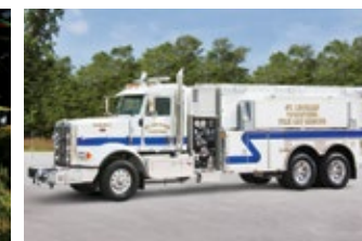
Cab extension with vertical exhaust