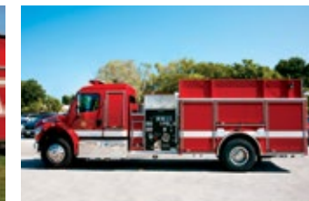
Extended cab – rollup door