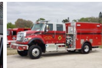
Extended cab pumper