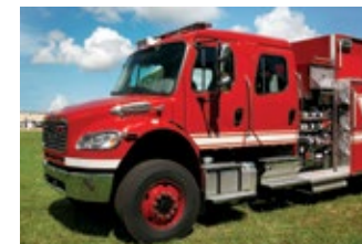
Freightliner M2-106, 4x4

Disclaimer: Some ratings not available with AWD or all cab styles.