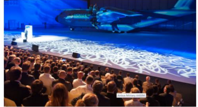
New Product Releases

Corporate Retreats & Management Conferences