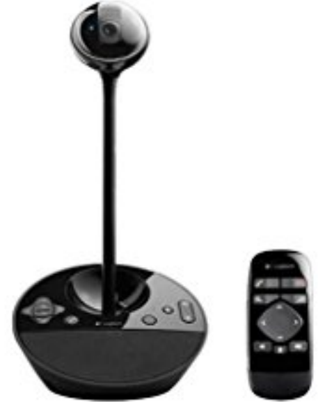
Logitech Conference Cam BCC950