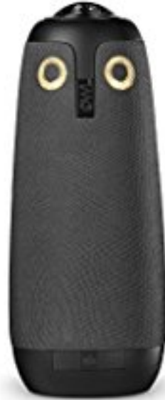
Meeting Owl 360