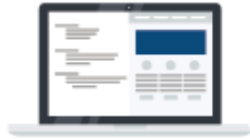
Web (IP, cookie)