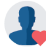
Health & Genetic