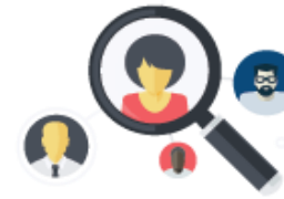
Social & political