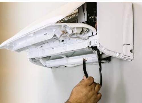
Unplug the wire harness