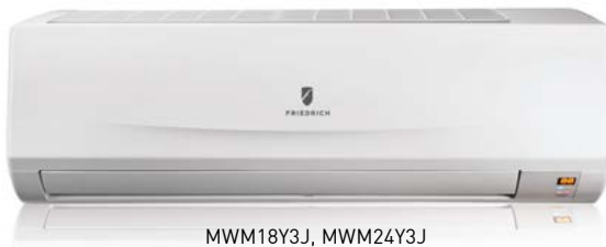
230/208 volt models