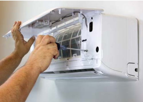
Back out electrical panel screws

YOU CAN ACCESS THE BLOWER WHEEL ASSEMBLY AND SLIDE IT OUT FOR FULL ACCESS TO THE INDOOR COIL