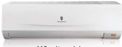
115 volt models MWM09Y1J, MWM12Y1J

Superb performance and excellent value, you get both at exceptional pricing.