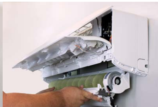
Remove screws then slide out the blower wheel assembly