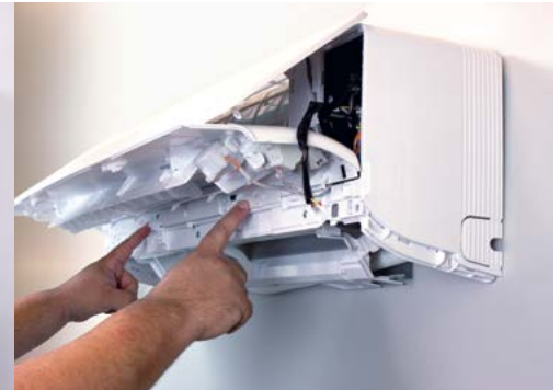
Lock the access panel