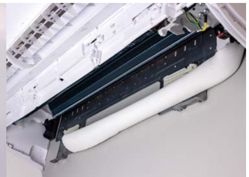
Complete access to the coils for easy cleaning

FastPro ™ Unique features for faster installation and easier service