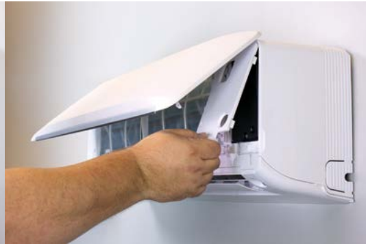
Remove electrical access panels [2]