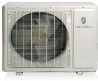
MRM18Y3J, MRM24Y3J, MRM36Y3J